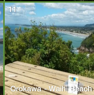
Orokawa - Waihi Beach