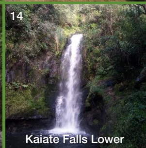
Kaiate Falls Lower