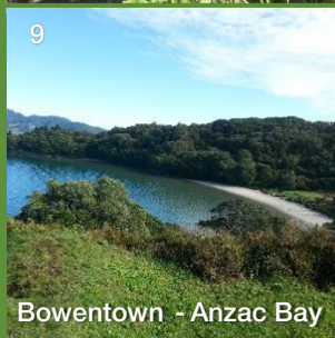
Bowentown - Anzac Bay