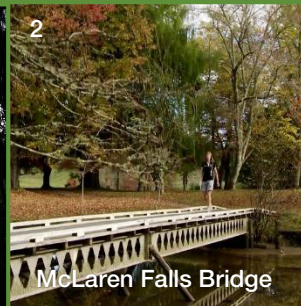
McLaren Falls Bridge