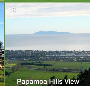
Papamoa Hills View