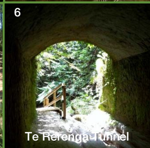
Te Rerenga Tunnel