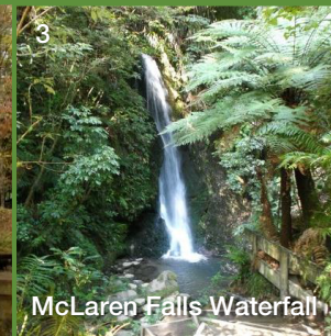
McLaren Falls Waterfall