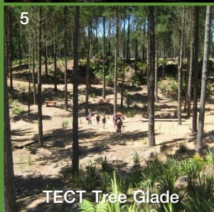
TECT Tree Glade