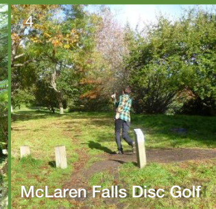
McLaren Falls Disc Golf