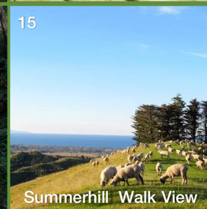
Summerhill Walk View