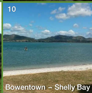
Bowentown - Shelly Bay