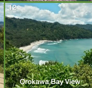
Orokawa Bay View